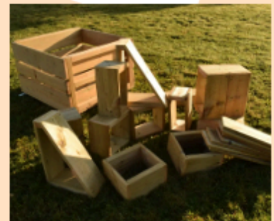
LARGE WOODEN BLOCKS

Please take a look and see if you are able to donate any items from the list to help support learning and play at Victor Seymour Infants school. Thank you!